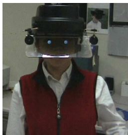
Fig. 1 HMPD prototype

Besides direct see-through capability, the HMPD technology intrinsically provides correct occlusion of computer-generated objects by physical objects, and creates ubiquitous display environments in which a retro-reflective material can be applied to anywhere in space and can be tailored to any shape without introducing additional distortion to the virtual images. Such a design also allows for larger field-of-view (FOV) and higher optical performance than eyepiece-based